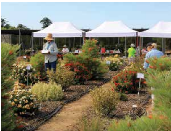
Visitors rate plants at a 2019 Open House of the trial fields at UC Davis.

Navigating the combined alphabet soup of MWELo, CIMIS, and WUCOLS can be daunting. This is the first in a series of articles on the UC Landscape Plant Irrigation Trials (UCLPIT) and the lessons we've learned in 16 years of research to help the industry understand and use plant factors (PF) in ways that benefit them, their clients, and the environment.