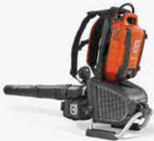
550IBTX BACKPACK BLOWER