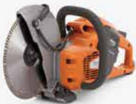
K535i POWER CUTTER