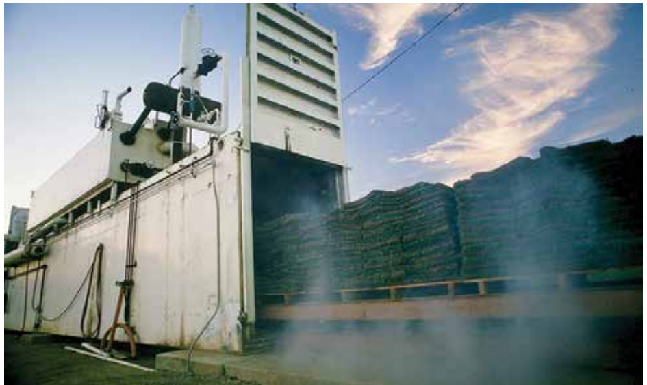
Southland Sod Farms' sod is placed onto a rail car, which is pushed into the vacuum chamber. As the vacuum is drawn down, the sod cools evenly throughout the pallet. This process reduces the sod pallet temperature to about 43 degrees in less than 20 minutes.

In addition to arriving "cool as a cucumber," Southland Sod Farms